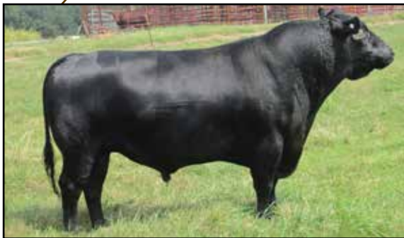
O Mr Banjo 41-147 Logo

The “41” cow and her full sister “40” have been the foundation in the Oliver program. She is the dam of Herd Sires “97” and “147”. She has a progeny WR 12@110 on a 373-day calving interval. She is a daughter of the $28,000 Alap of Wye.