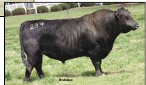
O Mr 97-120-234

She is the product of a son-dam mating. Sired by “97” and a direct daughter of “41”. She demonstrates the power in this gene pool and the ability for it to be linebred for consistency and prepotency.