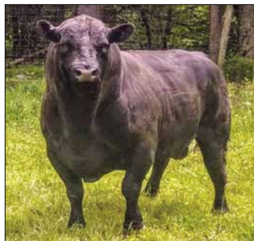
Baradine of Wye UMF 10508 - Maternal Grand Sire Lot 42