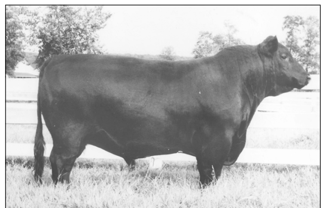
Churchill Of Wye - Sire Lot 3