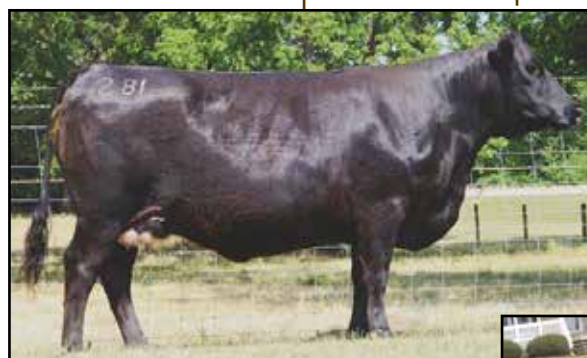
O Miss 97-41-281

Another son of “41” by the $14,500 “Clarkson of Wye”. He blends “Favour” and the great Wye Pathfinder “6767” and the “41” cow. His influence can be found throughout the offering and you will find many calves that are linebred to this sire and his dam.