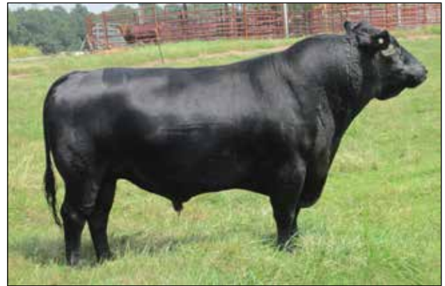
O Mr Banjo 41 147 Logo - Grand Sire Lot 2 Double Bred