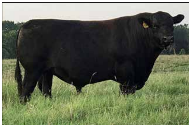
Breton of Wye UMF 11001 - Sire