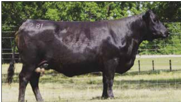
O Miss 97-41-281- Grand Lot 13

14 O Mr Jackson 11001 220 2144 Calved: 04/06/2021 Bull: 20068880 Tattoo: 2144