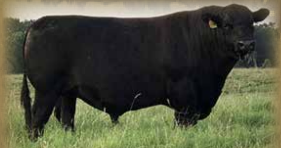
Breton of Wye Sons Sell

The Oliver Herd is Well Known for Producing Maternally Efficient, Problem-Free, Docile, Easy-Fleshing Cattle that Excel on Grass.