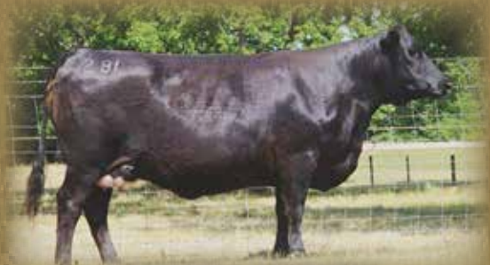
Cows Like This Sell