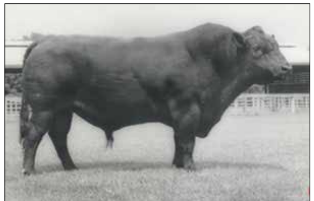
Father of Wye