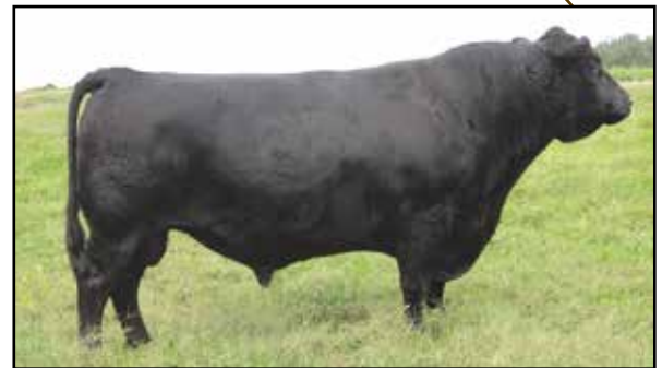
O Mr Casey 41-97

He is a direct son of the “41” Matriarch and by the well known female producer, “Banjo of Wye”. His influence sells throughout the offering as the Grandsire of many and many are linebred to him.