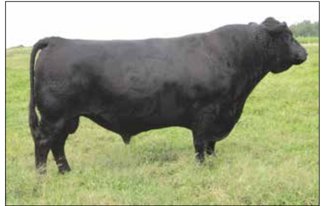
O Mr Casey 41 97 - Maternal Grand Sire Lot 1 Line Bred to "41"