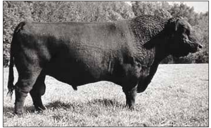
Favour Of Wye