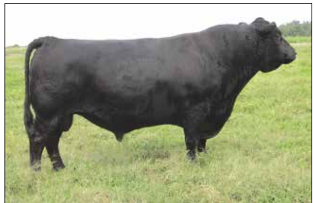
O Mr Casey 41 97 - Maternal Grand Sire Lot 16

17 O Miss Breton 111 025 Calved: 01/04/2020 Cow: 19738484 Tattoo: 025