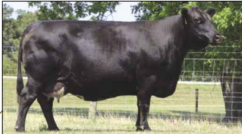
O Miss Alap L 2246-41

The “41” cow and her full sister “40” have been the foundation in the Oliver program. She is the dam of Herd Sires “97” and “147”. She has a progeny WR 12@110 on a 373-day calving interval. She is a daughter of the $28,000 Alap of Wye.