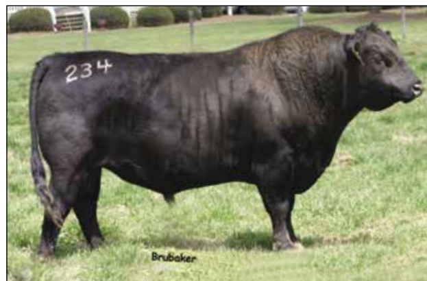
O Mr 97-120-234 - Maternal Grand Sire Lot 5