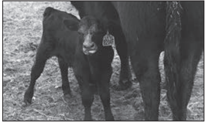
1571 WITH BULL CALF 8204F KEPT FOR 2020 SALE.

This Cow Bull stems from a proven blend of Wye, Emulation and Rito. His dam is an own daughter of 5522 and our Foundation Female 420. 7201 ratios 105 for WW and 104 for YW. He should sire productive, long-lived, fertile females and stout scale-topping calves.