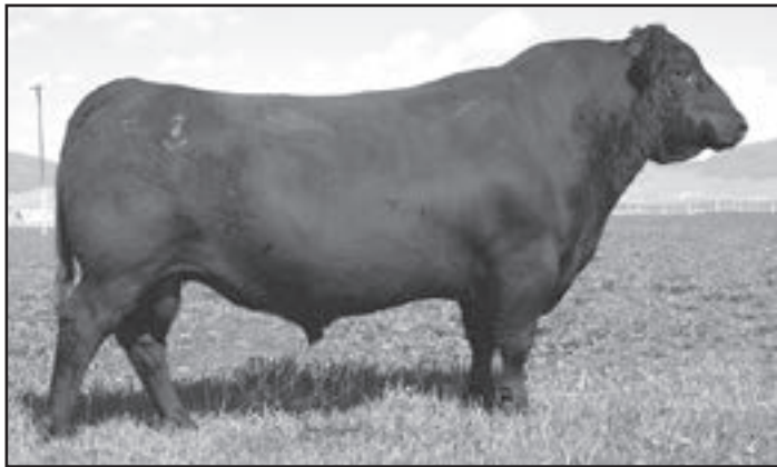
OCC GREAT PLAINS 943G