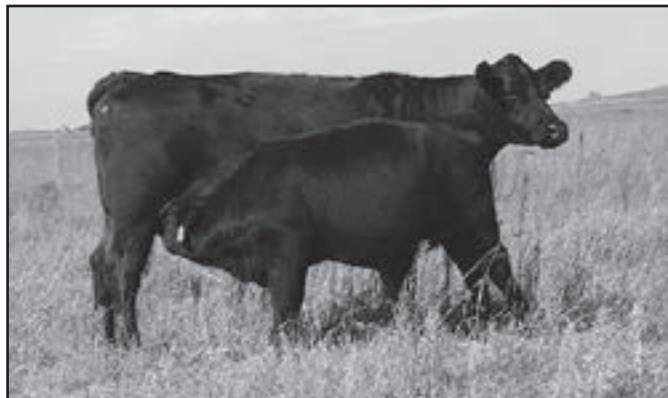
5637, MATERNAL SISTER TO LOT 48 AND GRAND DAUGHTER OF DAM OF LOT 86 WITH RETAINED HEIFER CALF.