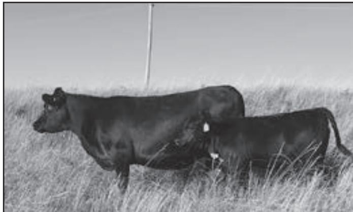
4506, MATERNAL SIB TO LOT 46, WITH HER RETAINED HEIFER.

This Heifer Bull's sire has done a really good job of producing calving ease sires with growth. The cows in this pedigree are long-lived and have produced very well. 7237 ratios 98 for BW and 101 for WW, 102 for YW, and 113 for %IMF. 7237 calves should come easy, grow, and have quality carcasses. His daughters should become long lived Bonsma style cows with excellent teat and udder structure.