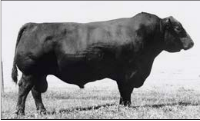
RR RITO 707

Rito 707 was the top yearling weight bull and the top-gaining bull with a gain ratio of 129 in the 1968 PIC Bull Test. He recorded an individual weaning ratio of 118 and an individual yearling ratio of 123. His dam, Eriskay of Rollin Rock, recorded an individual weaning ratio of 108 on six calves, a progeny gain ratio of 112 on five head and a progeny yearly ratio of 112 on five head, all prior to the implementation of AHIR. His Weaning Weight EPD is nearly 40 pounds greater than the estimated average of his birth year and his Yearling Weight EPD is 70 pounds greater. His Daughter Data and the performance of his sons (e.g. Rito 149, Rito 72, F0203) and grandsons such as SAV Resource 1441 and SAV Renown 3439 prove he is without peer.