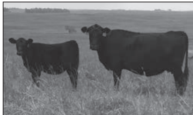
1546, DAM OF LOT 81, WITH RETAINED HEIFER CALF.

This Cow Bull is a unique breeding of 707 with a dam, 1JP2 8X9, who was sired by Jipsey Earl a 100% Scotch pedigreed bull who earned a Pathfinder Sire award. 1JP2's dam is 8X9 who is a full sister to Sinclair Emulation XXP. 1JP2 has progeny ratios of 107 for WW, 102 for YW, and 109 for IMF, and 100 for REA. 7132 blends three prepotent lines of cattle into one very functional and appealing package that offers great carcass quality with a 126 %IMF ratio. A maternal brother sold to Chad Hollenbeck of Rose, NE last year. Full Brother to Lots 8 and 18!