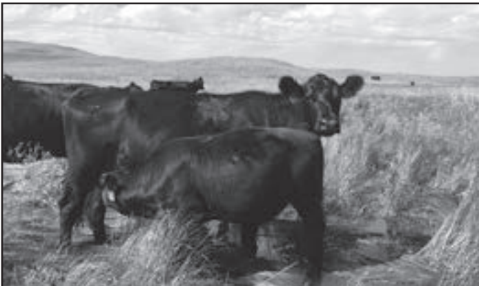
1443 WITH BULL CALF 8154F KEPT FOR 2020 SALE.

This Cow Bull is a maternal sibling to the high selling sire group from last year's sale, which were sired by F0203, a son of Rito 707. Since F0203 worked so well, we thought F0203's sire - Rito 707 - would work just as well. He did! 7129 is the perfect blend of Rito, Wye, and Emulation. His dam, Foundation Female 740, has proven predictability because she ratios 5/106 for WW, 4/105 for YW, 8/105 for %IMF, and 8/100 for REA. Herdsires produced from 740 have been selected by the Arabia Ranch, Cotton Angus, Mosier Angus Ranch, Epling & Son Angus, and Henderson Ranch. Full brother to Lots 29 and 33.