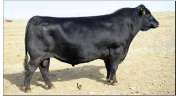
Sinclair Added Value 5PV44