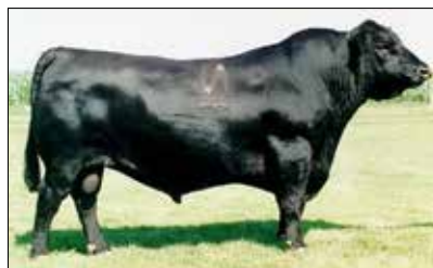
N Bar Emulation EXT

> Sells with her 4/8/18 heifer calf by DR 304 of EXT > Pasture exposed to DR 304 of EXT > She blends Rito 707 with Hero 6267. Ranks in top 10% on $EN