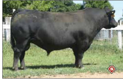
Sinclair In Time 6BT39